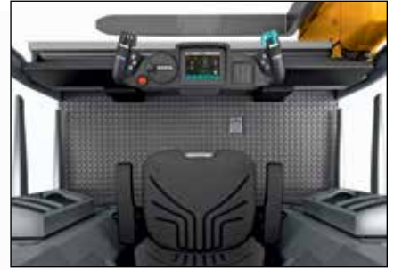
Center operation control (standard on all EKX 4 and 5 series configurations)