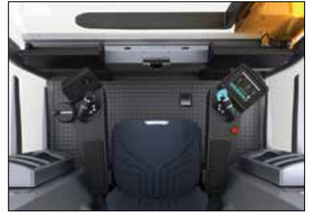
Split operation control (optional on all EKX 4 and 5 series configuration, but not compatible with freezer package on any model)